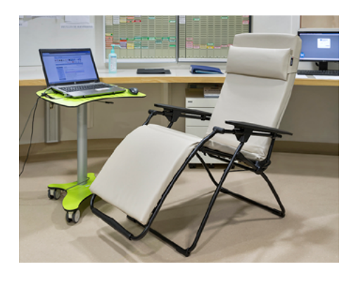
VITAL Relax Grège