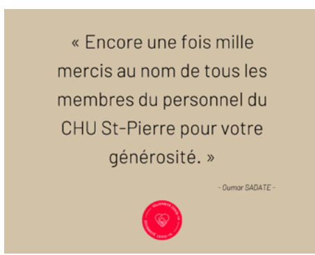
Brussels St-Pierre University Hospital