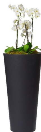
Ref. 113.410 C - Orchids in bac black Partner total ht 1 / 1,10 m