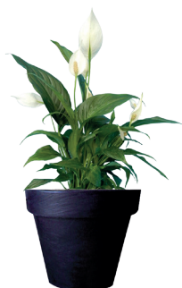
Ref. 113.310 - Spatiphyllum Sensation ht 1,20/1,50m Ref. 134.359 - Vas three black