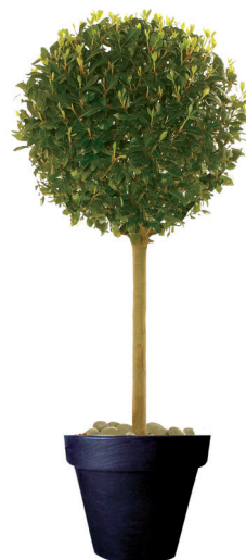
Ref. 112.160 - Bay tree globe ht 1,80m Ø60cm Ref. 134.359 - Vas three black