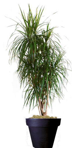
Ref. 113.130 - Dracaena fragrans ht 1,80/2m Ref. 134.359 - Vas three black