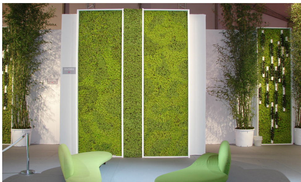
Prices on demand