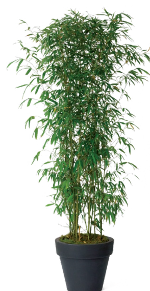
Ref. 111.110 - Bamboo ht 1,50 / 2 m Ref. 134.359 - Black vas three