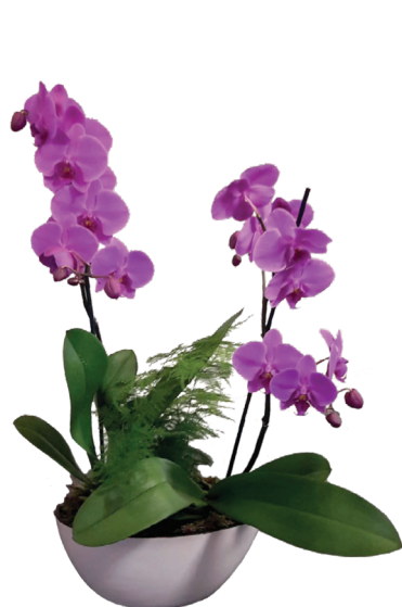
Ref. 182.200 - Bowl of flowers Ø 30 cm