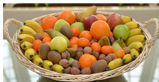
Ref. Pafruit 10K