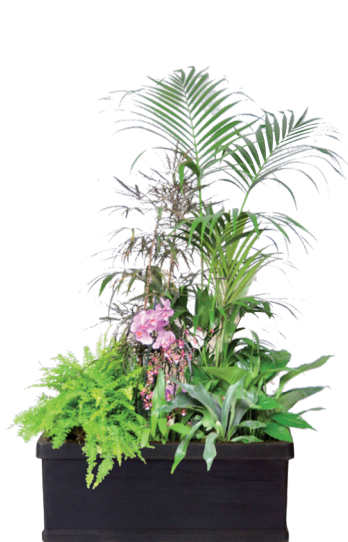
Ref. 143.200 - Black rectangular pot 100 x 32 cm Plants composition