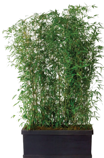
Ref. 142.960 - Black rectangular pot 100 x 32 cm Bamboo hedge ht 2 / 2,50 m