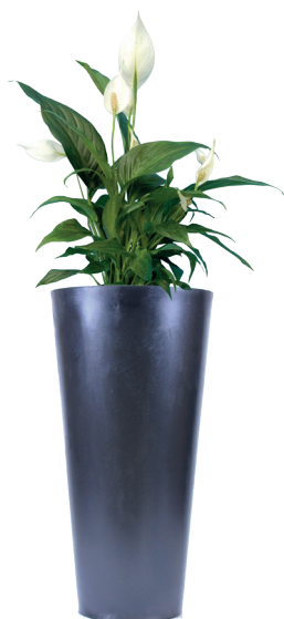
Ref. 113.300A - Spatiphyllum sensation in black Partner pot ht 1,80 / 2 m