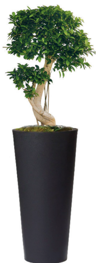
Ref. 113.410 A - Bonsai ficus nitida in black Partner pot total ht 1,20 / 1,50 m

Our floral selection or composition is beyond the capability or creativity of our master gardeners. We guarantee to find the right arrangements for you.