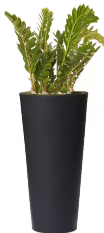
Ref. 113.410 B - Zamioculcas in black Partner pot total ht 1,30 / 1,50 m