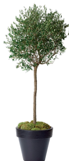
Ref. 112.020 - Olivier Ref. 134.359 - Black vas three