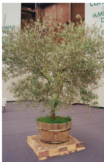
Ref. 122.160 - Olive tree Ø 1,50m ht 2,50/3m